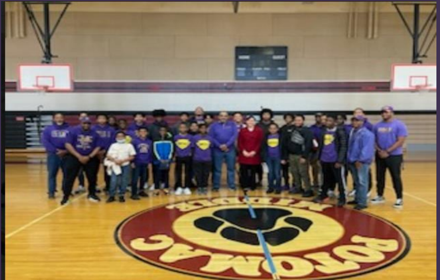
Apple Federal Credit Union presented the financial literacy event to the Omega U students and their parents

To be financially literate is to know how to manage your money. This means learning how to pay your bills, how to borrow and save money responsibly, and how and why to invest and plan for retirement.