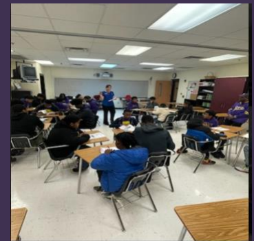
Apple Federal Credit Union gives presentation on financial literacy