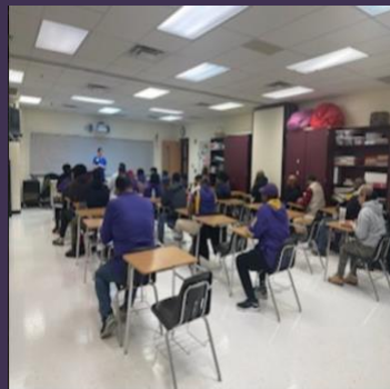
Students and parents are preparing to break out into groups