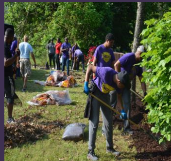
Omega U students working hard at the clean up