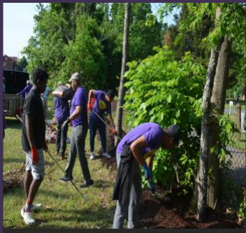
Omega U students working together in the beautification of the cemetery