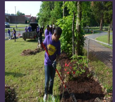
Omega U mentee assisted in the clean up as well